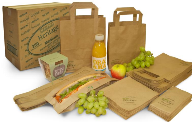
The newly revised and extended Heritage range

For more information, please contact Dempson Ltd on 01622 727027 or visit: www.dempson.co.uk